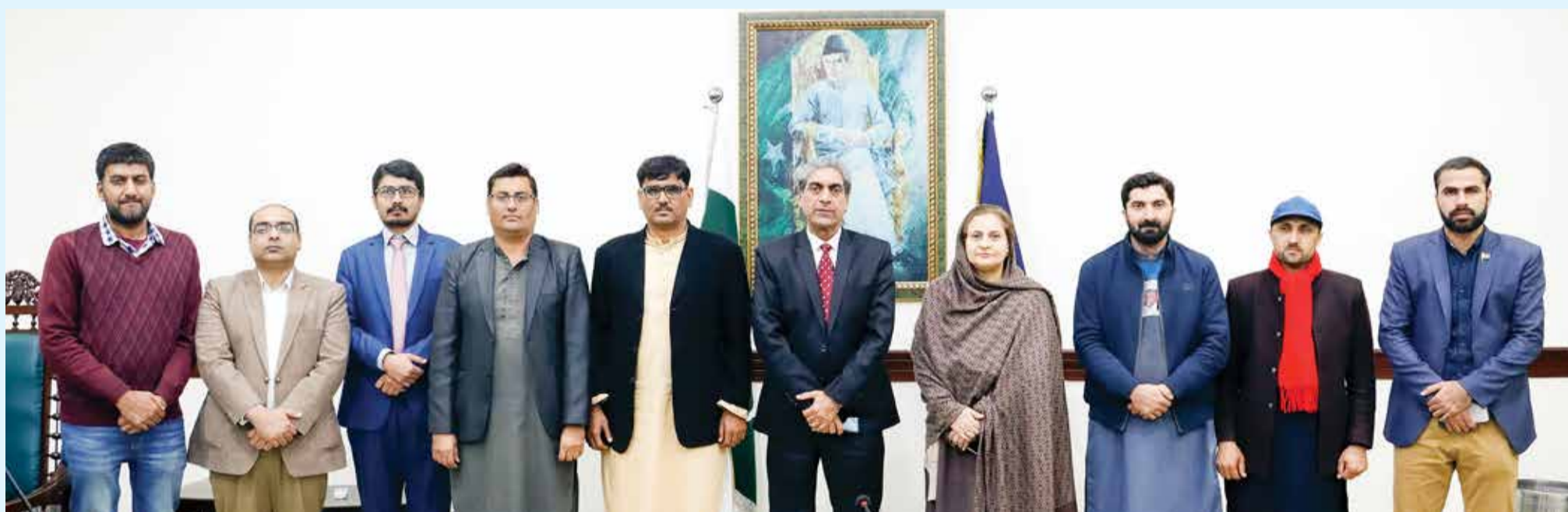
Group photo of the organizers of Kashmir Solidarity Webinar

Islamia University of Bahawalpur thanked all the participants and said that the Islamia University of Bahawalpur will continue to work for the independence of Kashmir through its research scholars and stands by the Kashmiri people for the independence of Kashmir.