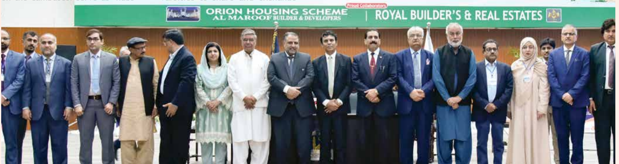
Group photo of the dignitaries of Inter-University Consortium on Climate Change, Sustainability and Conservation

scientific knowledge, research outcomes, physical infrastructures, and other resources where suitable.