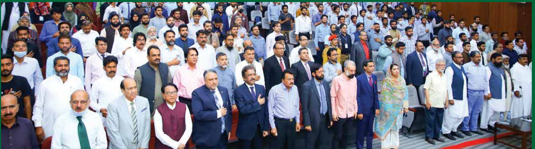
A view of inaugural ceremony