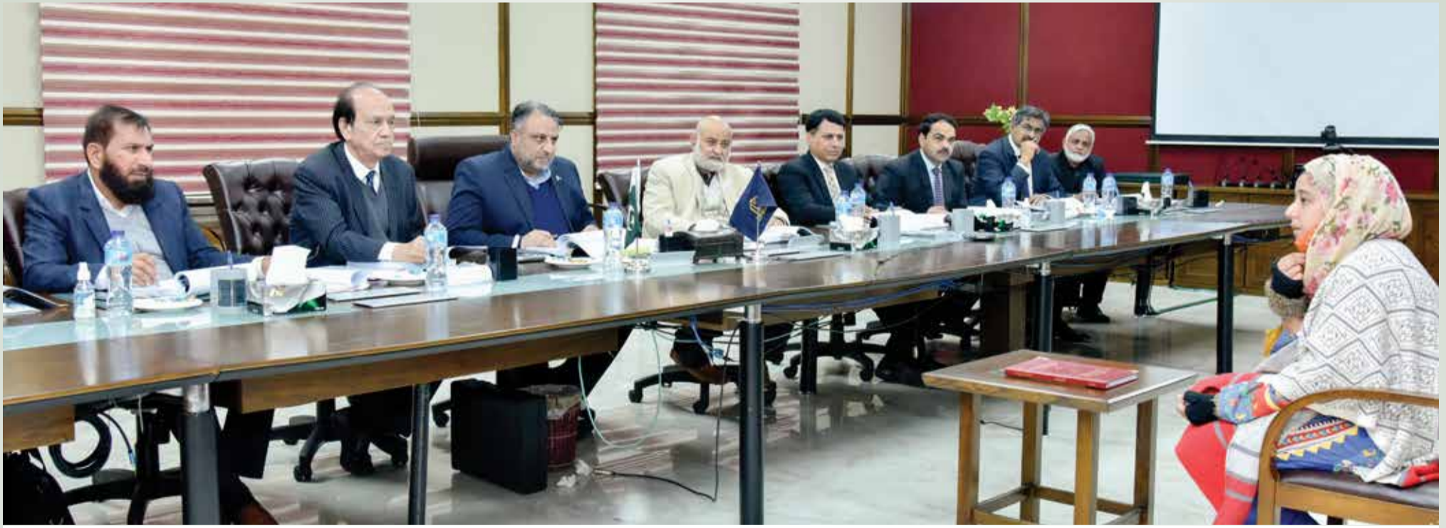
A view of selection board meeting at Vice Chancellor's Secretariat