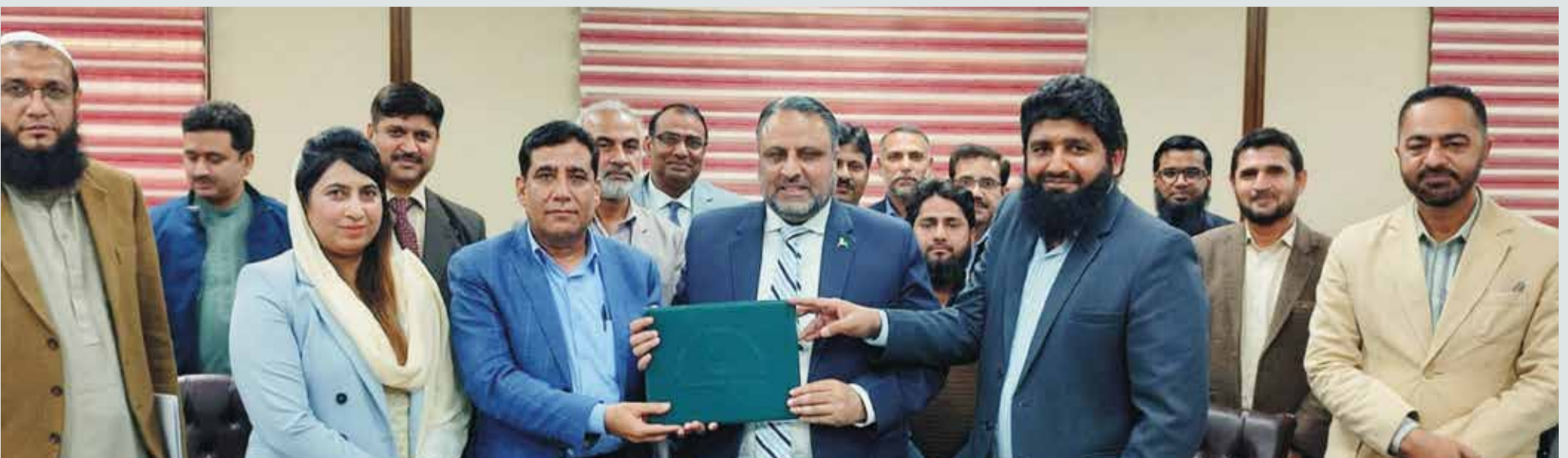
A view of MoU signing ceremony

University of Bahawalpur has provided testing facilities to various other institutions. Similarly, admission and recruitment tests of the Islamia University of Bahawalpur have been conducted by University Testing Service in the last two years.