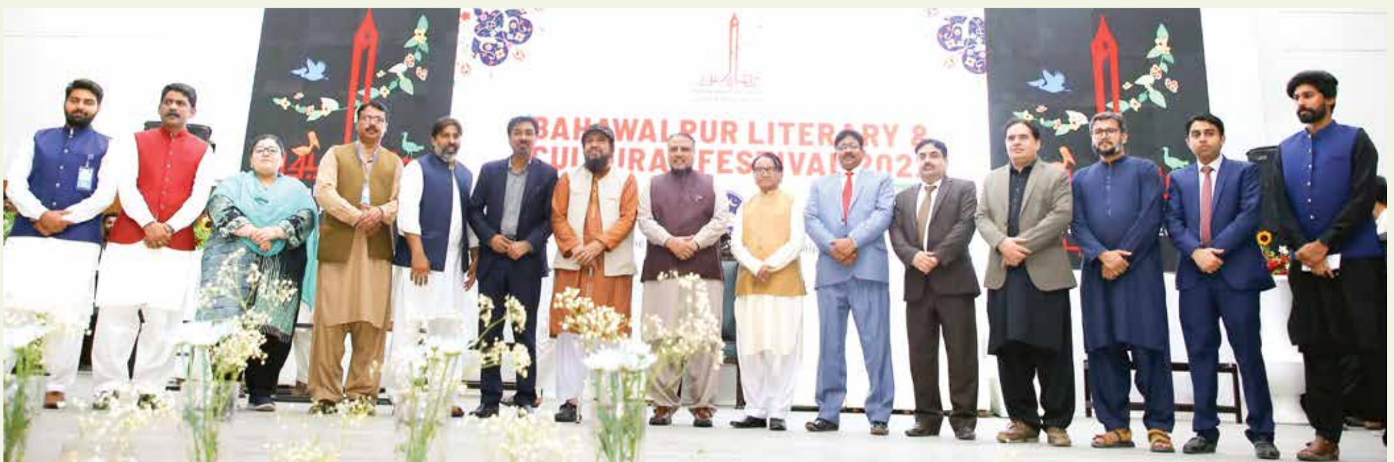
Glimpses of Bahawalpur Literary and Cultural Festival 2022