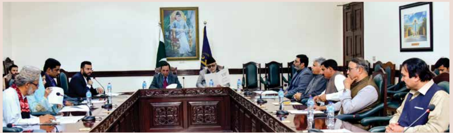
Meeting IUB Khawaja Ghulam Farid (R.A.) Chair