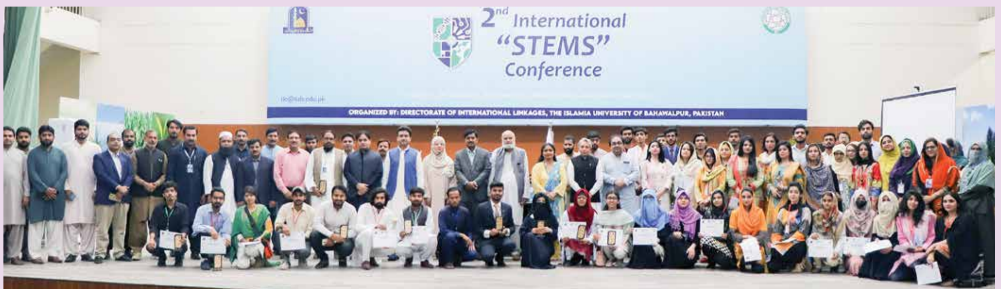
A group photo of participants and organizers of STEMS Conference-2022