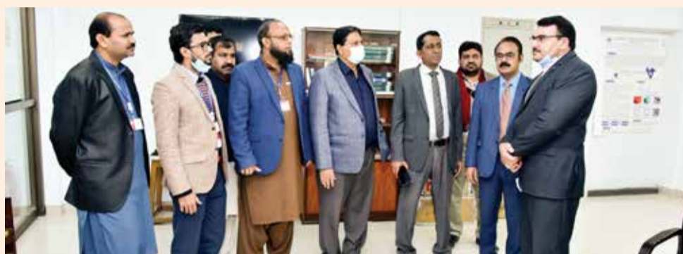
Delegation of Government Colleges University Hyderabad visits Baghdad ul Jadeed Campus