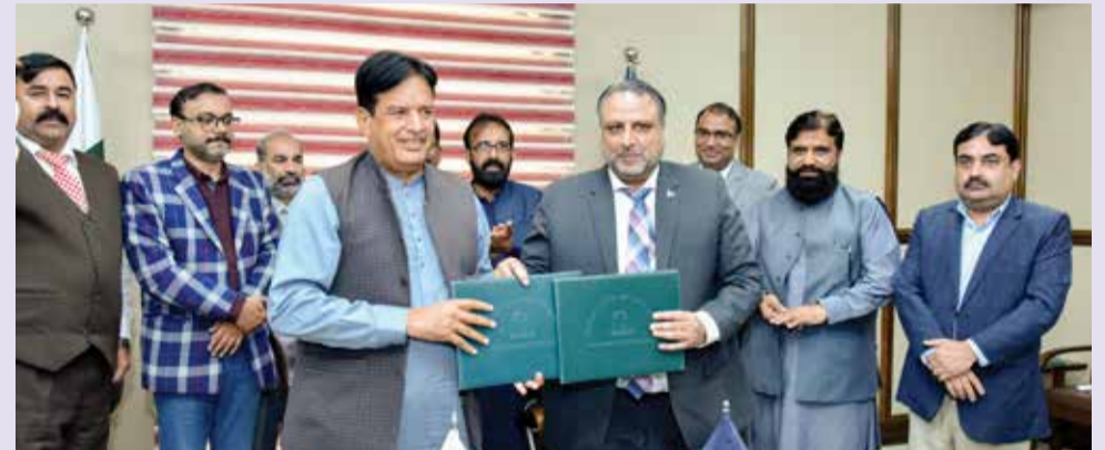
A View of MoU signing ceremony