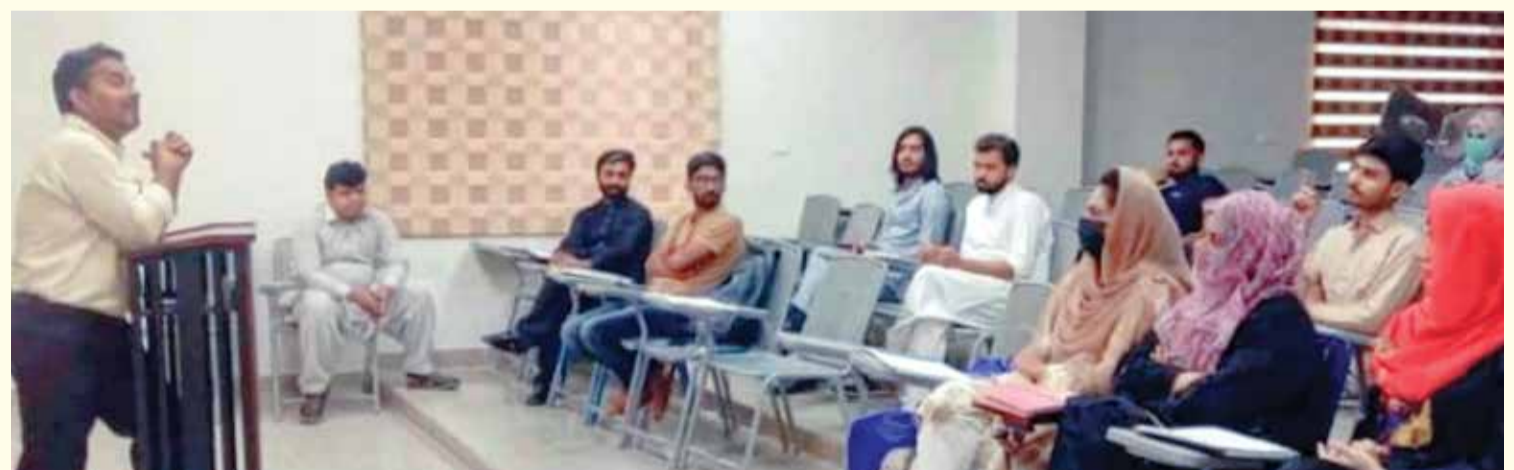
A view of the introductory session of CSS preparation class at IUB Competitive Exam Academy