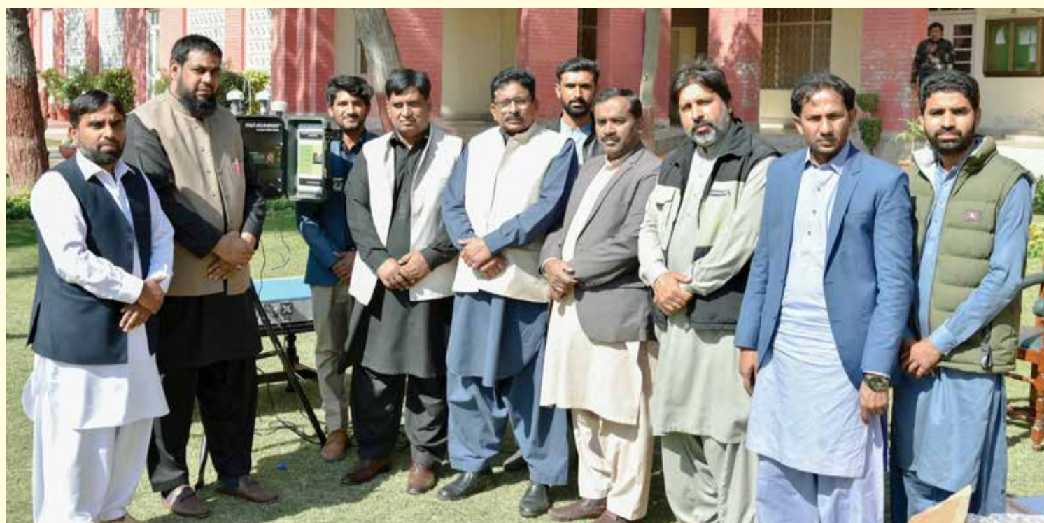
A group photo of team installing air quality sensors and equipments