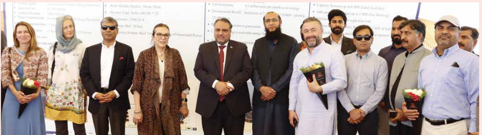
Group Photo of the Delegates of South Punjab Development Dialogues along with Vice Chancellor IUB at Hakra Art Gallery, IUB

Islamia University of Bahawalpur especially 40% female students. On this occasion, the members of the delegation were informed that under the Ehsaas Scholarship Program, Higher Education Commission Pakistan, Government of the Punjab, British Scholarship Program, more than 13,000 students are benefiting from scholarships of Rs. 700 million.