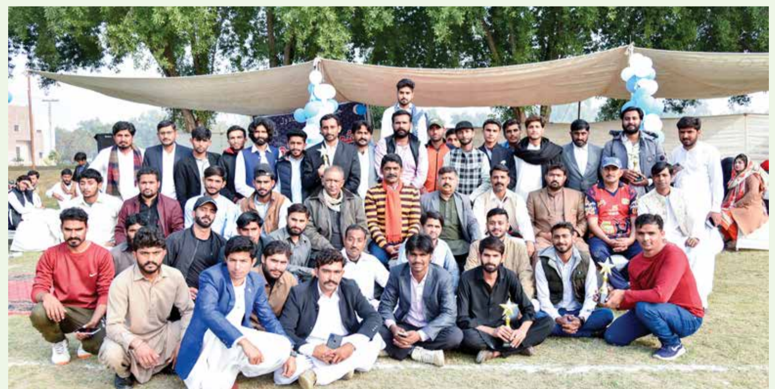
Faculty members and students of Department of Siraiki at Sports Complex