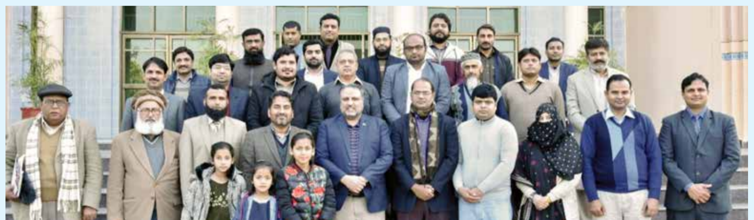
Group photo of the participants of training session on Career Counseling and Career Growth