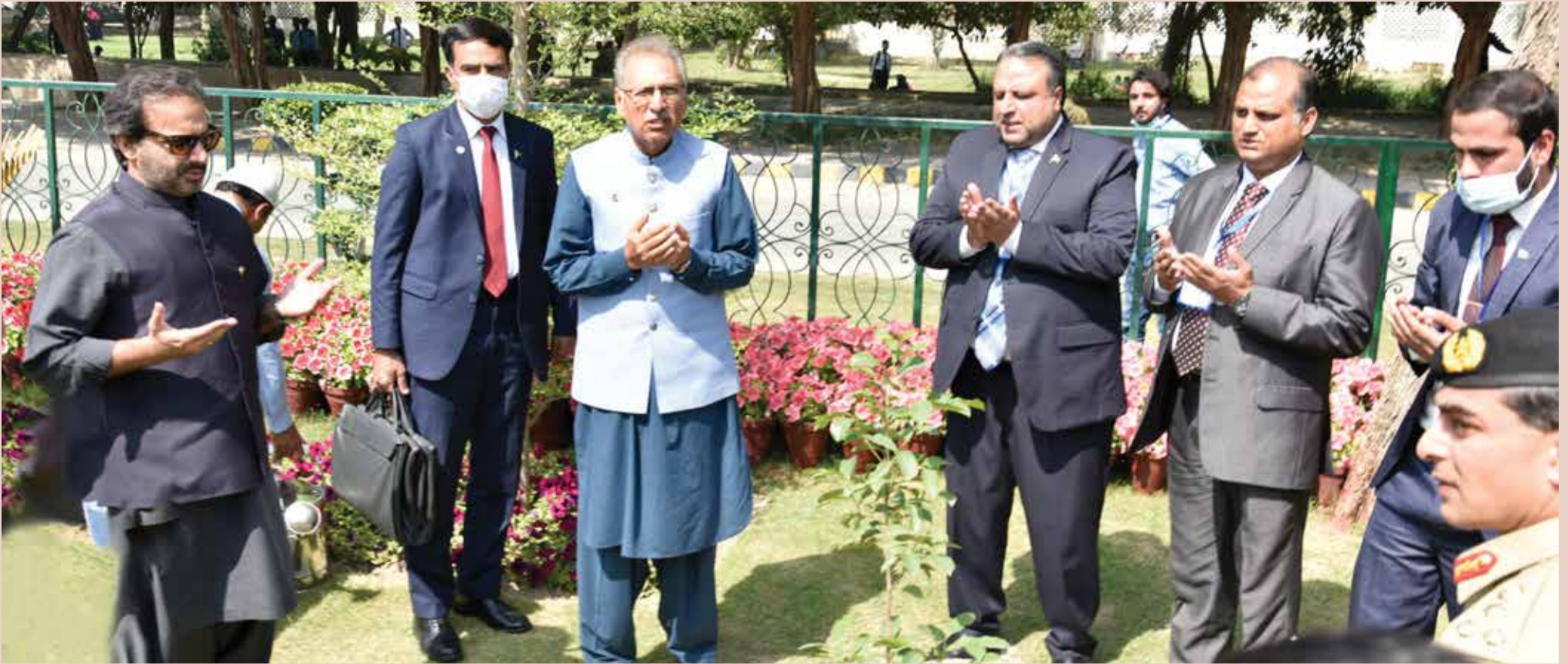
Honourable President Islamic Republic of Pakistan Dr. Arif Alvi planting a tree at Vice Chancellor's Secretariat