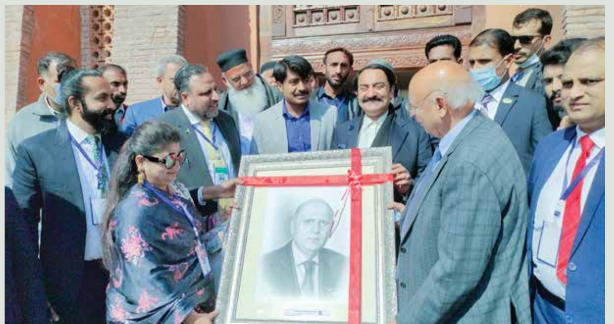
Faculty members of College of Art and Design presenting a portrait to the Governor of the Punjab at Hakra Art Gallery