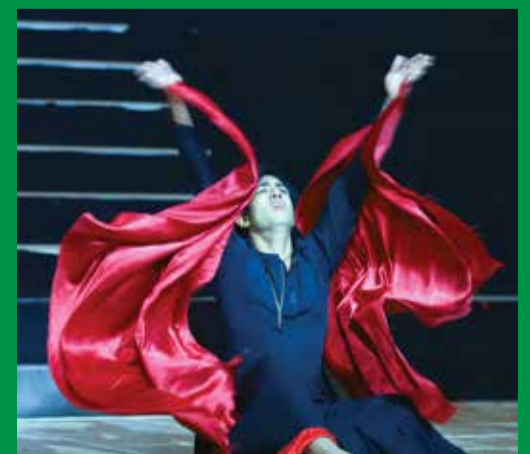
Glimpses of Bahawalpur Literary and Cultural Festival 2022