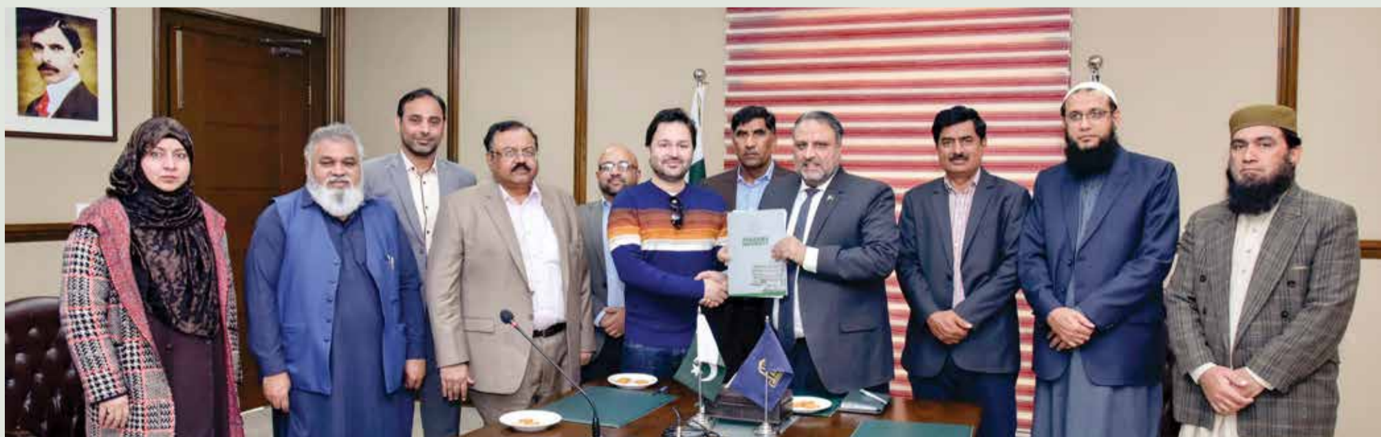
A view of MoU signing ceremony