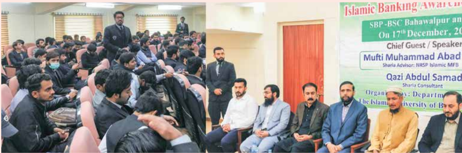
A view of the participants of Islamic Banking & Finance

Department of Commerce, the Islamia University of Bahawalpur in collaboration with Bank of Khyber, National Rural