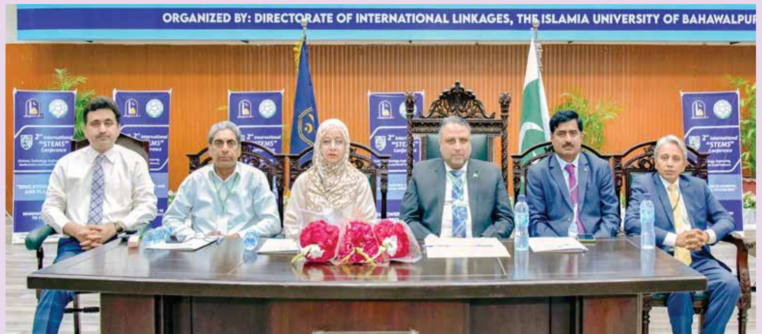
A view of second international Conference on Science, Technology, Engineering, Mathematics, and Social Sciences (STEMS-2022)