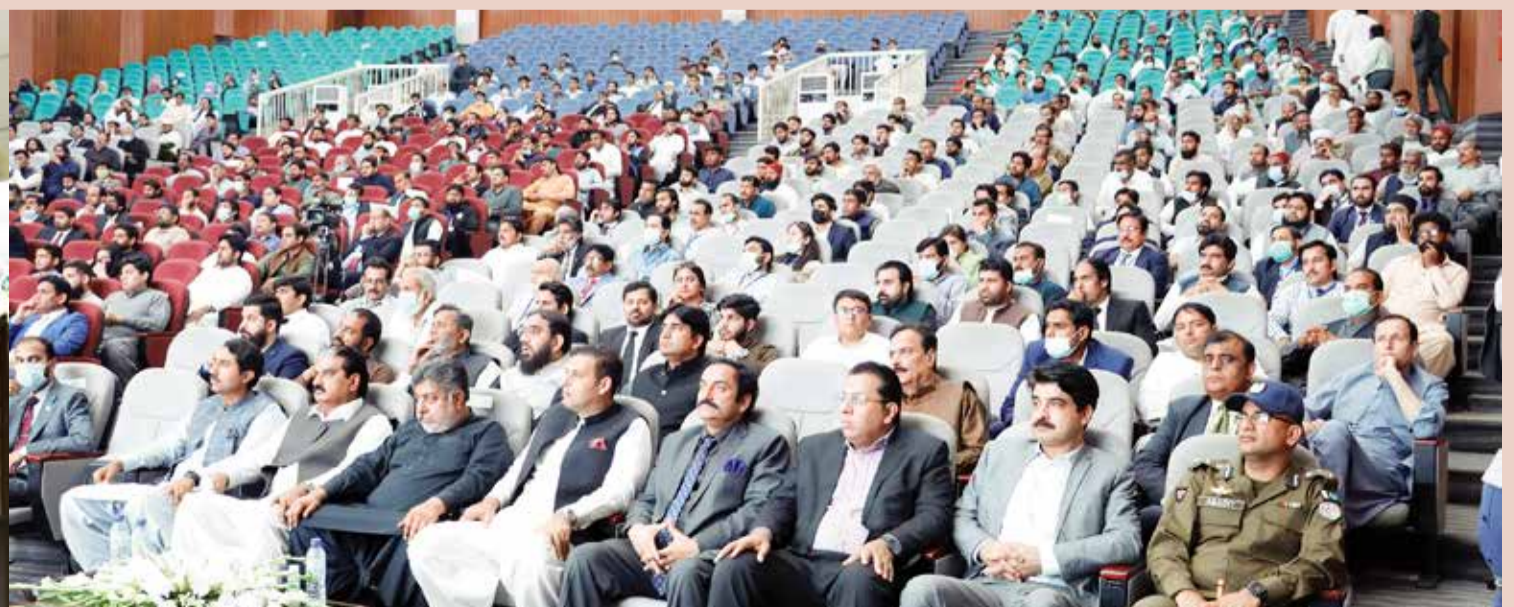
Honourable President Islamic Republic of Pakistan Dr. Arif Alvi giving address to faculty and students