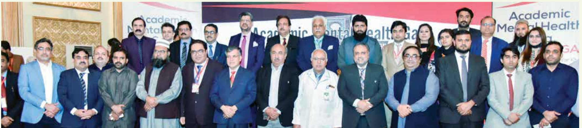
Group photo of the participants and organizers of Academic Mental Health Gala at Sheikh Zayed Medical College Rahim Yar Khan

professional for his contribution to the mental health. An MoU was also signed at this occasion between the Islamia University of Bahawalpur Rahim Yar Khan Campus and Sheikh Zayed Medical College for future collaborations.