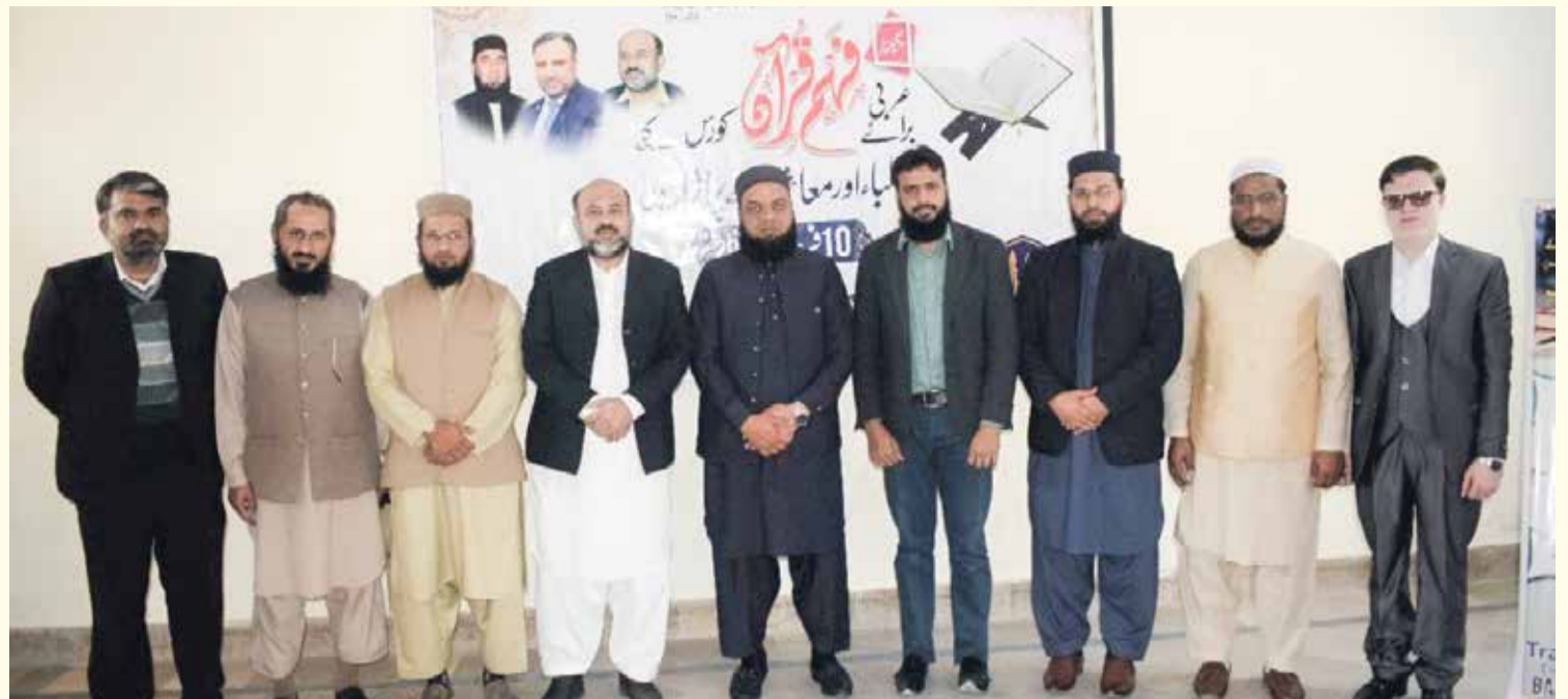
Group photo of Director Bahawalnagar Campus and participants of the Seminar