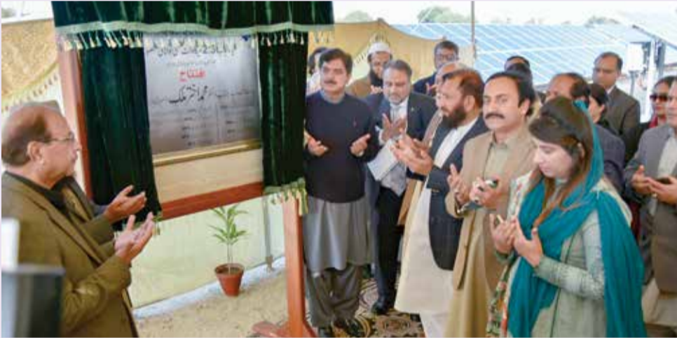
Provincial Minister for Energy inaugurating the solarization of Baghdad ul Jadeed Campus

Islamia University of Bahawalpur is providing of green and clean energy to Bahawalpur. The Vice Chancellor extended his gratitude to the Provincial Minister for Energy for further expanding the project and support in generating more electricity from the project. The Vice Chancellor thanked the