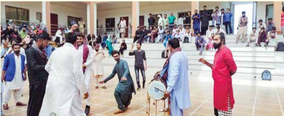
IUB Faculty members and students celebrated Punjab Cultural Day

T he Islamia University of Bahawalpur celebrated Punjab Cultural Day with full zeal and zest. Officers and community of the area actively participated in various events. Students, faculty and officers came in cultural dresses. In this regard beautiful flower stalls were decorated at Jashan-e-Baharan Mela and various cultural