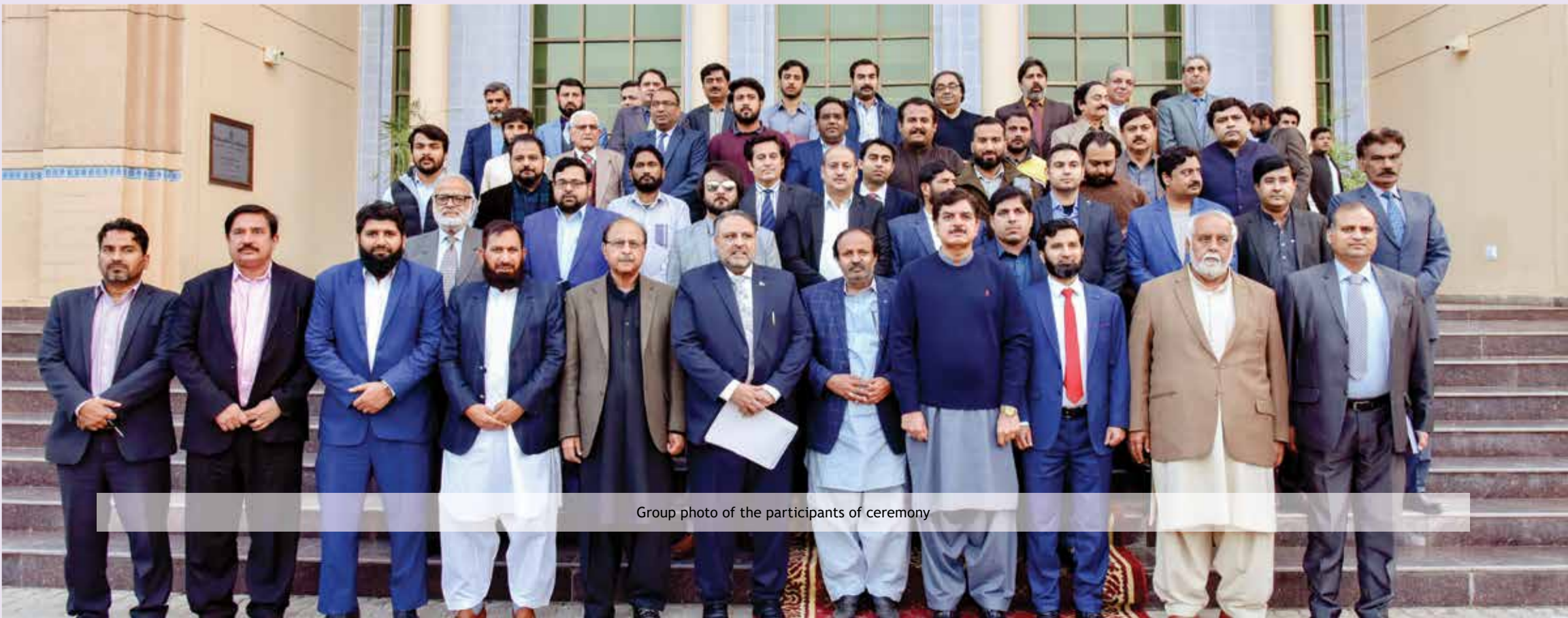
Group photo of the participants of ceremony

Punjab government for setting up Centers for Excellence for Renewable and Solar Energy Technology at Bahauddin Zakaria University Multan and the Islamia University of Bahawalpur in which training will be imparted to the students. A large number officers, faculty and students were present on the occasion.