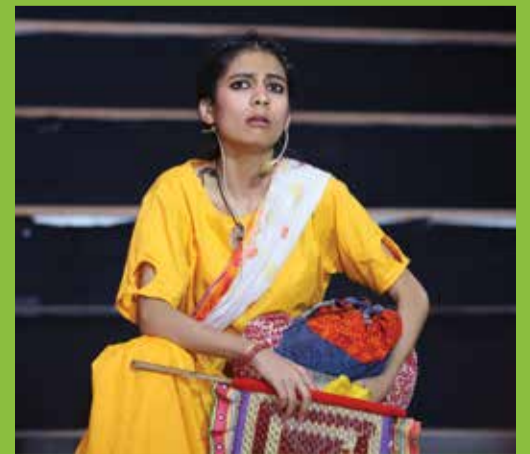
Glimpses of Bahawalpur Literary and Cultural Festival 2022