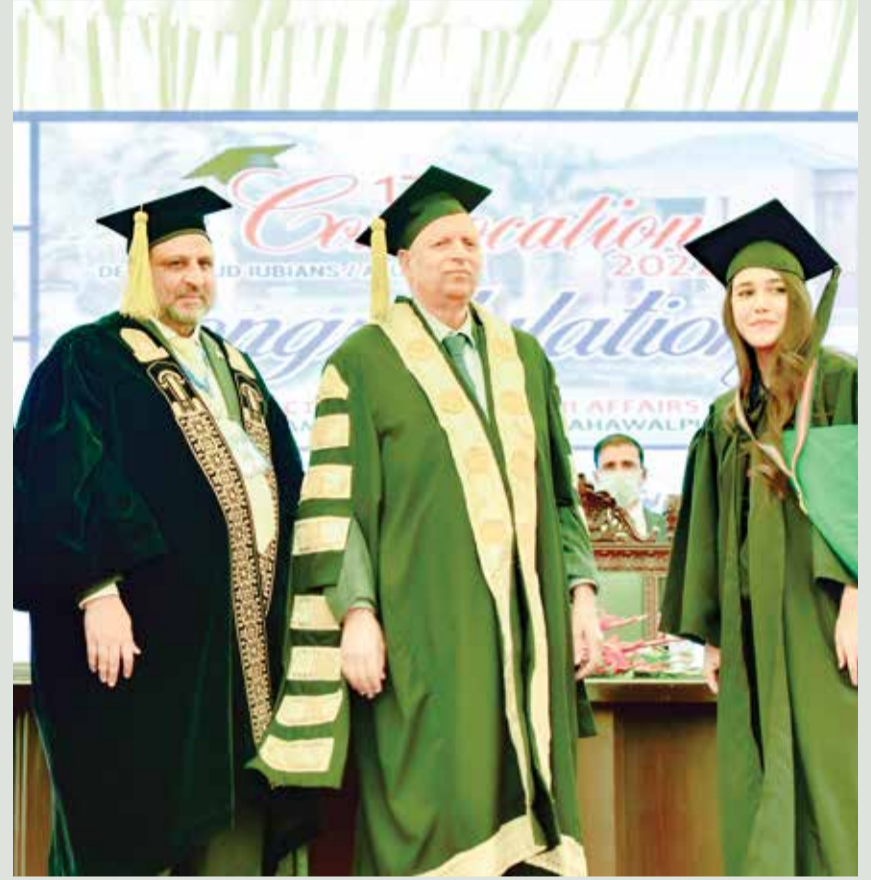
Graduates receiving degrees and medals in the 17 th convocation