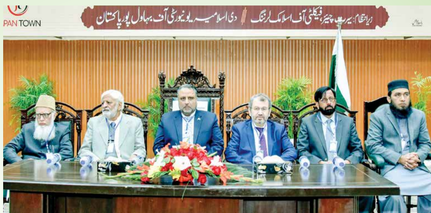
A View of 8th International Seerat Conference inaugural ceremony