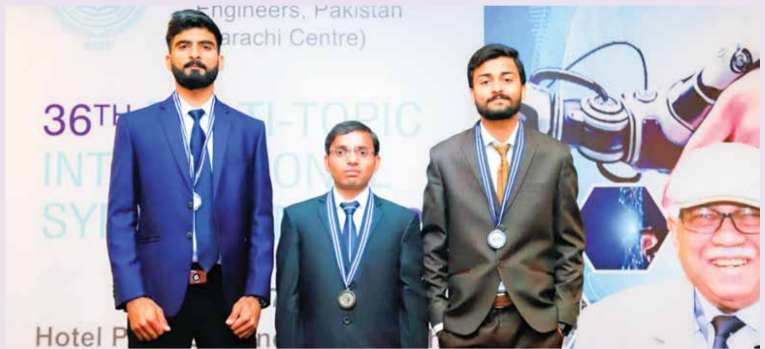
IUB Runner up team of IEEE Competition at Karachi