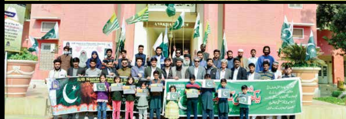
Group photos of Kashmir solidarity walks in various IUB campuses