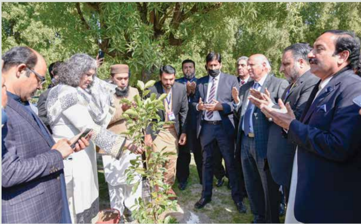
Governor Punjab Chaudhry Mohammad Sarwar planting a tree at Vice Chancellor's Secretariat