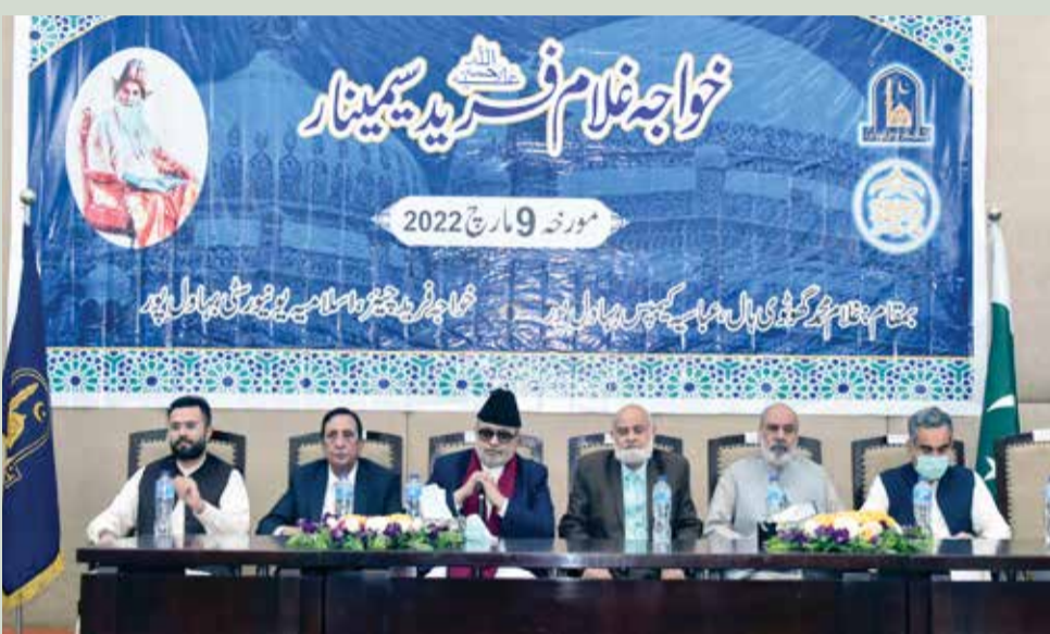
A view of Grand Khawaja Ghulam Farid (R.A.) Seminar