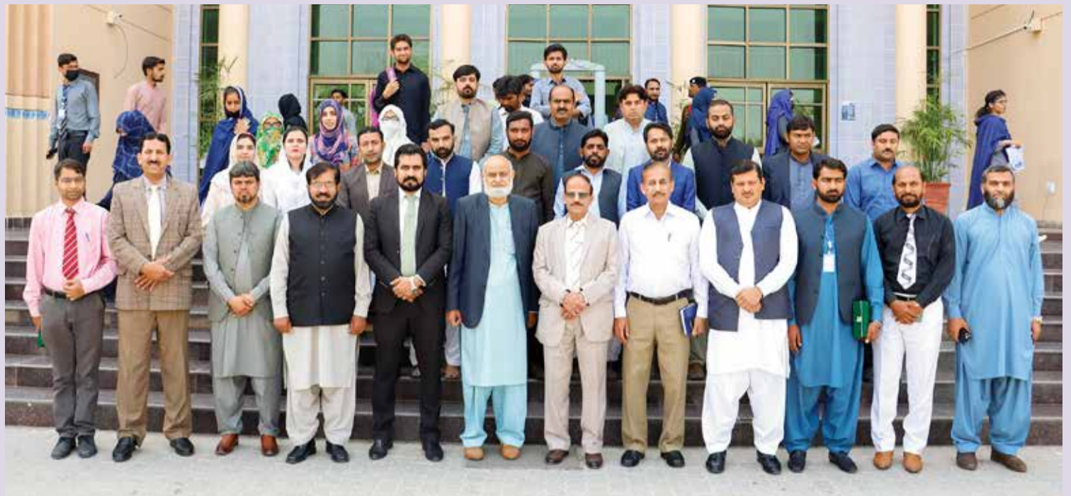
Group photo of the participants of First International Conference on Online and Distance Education