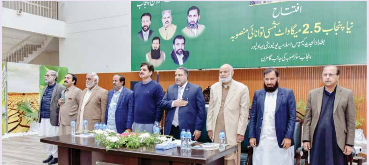
A view of Baghdad ul Jadeed Campus solarization ceremony