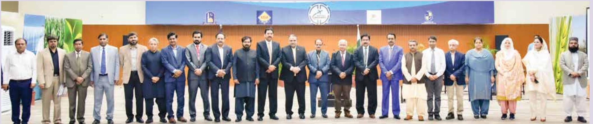
Group photo of the participants at Main Auditorium

present times have affected all spheres of life, especially covid-19, and the education sector has also been affected. To address these challenges, it is important for policy makers, researchers and experts to come together on a single platform, for which the efforts of the Islamia University of Bahawalpur are commendable.