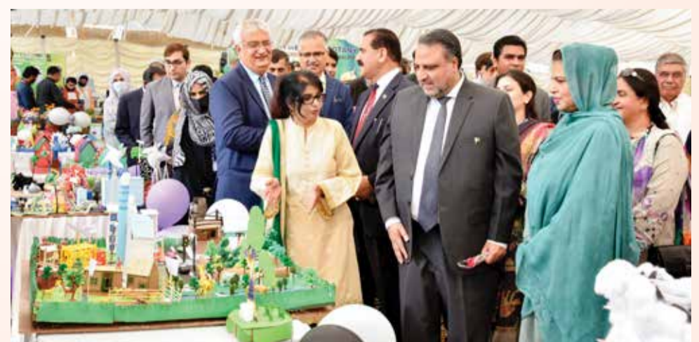
Botanical Exhibition by Department of Botany