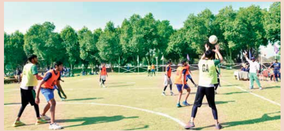
A View of the Netball Ground, Baghdad ul Jadeed Campus, IUB