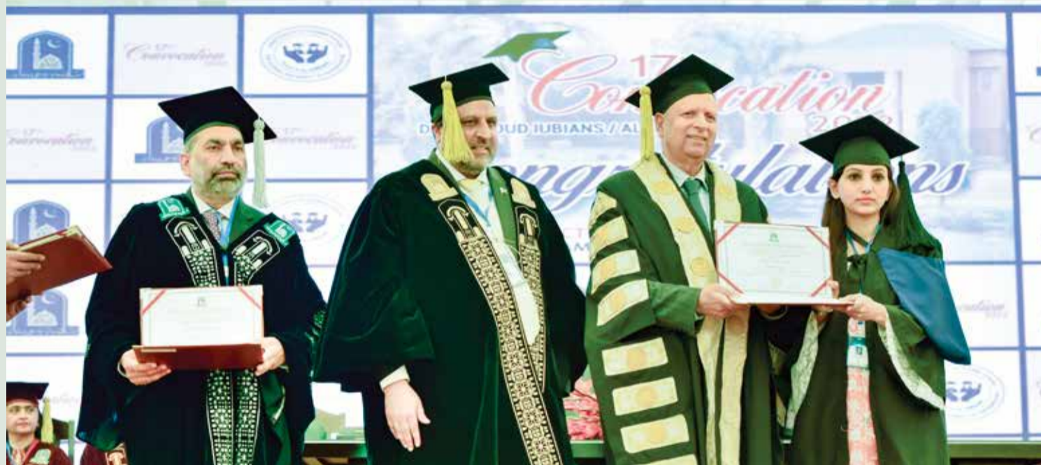
A graduate receiving degree in convocation ceremony