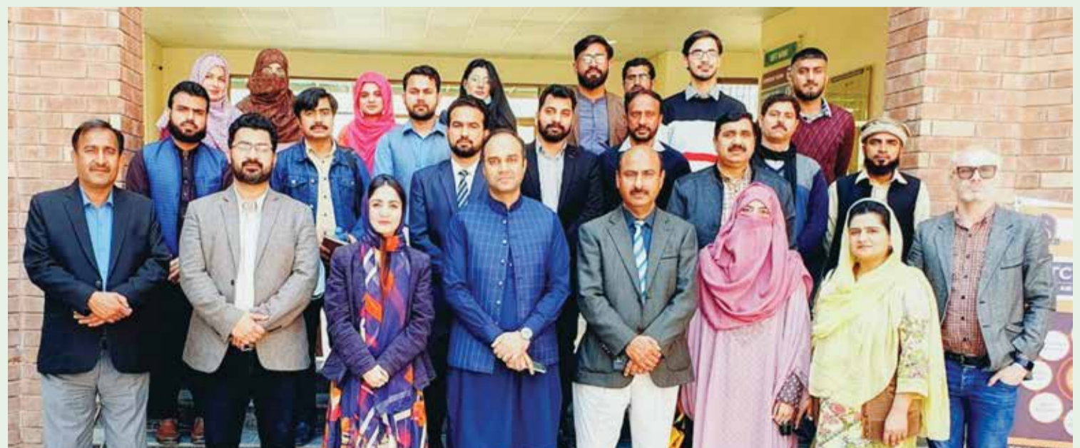
Group photo of the participants and organizers of training workshop