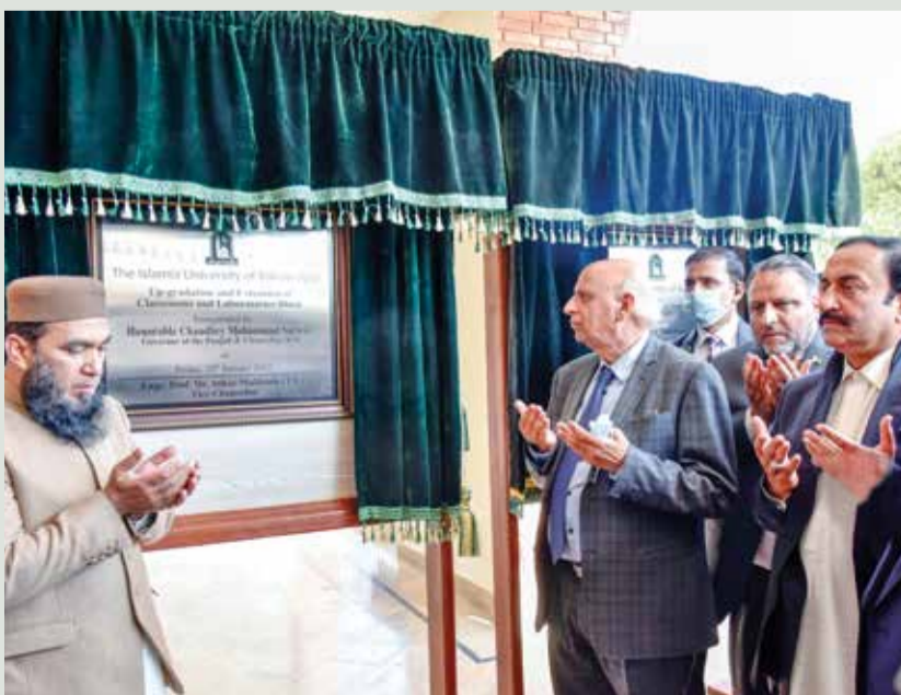
Governor Punjab Chaudhry Mohammad Sarwar inaugurating up-gradation and extension of classrooms and laboratories block