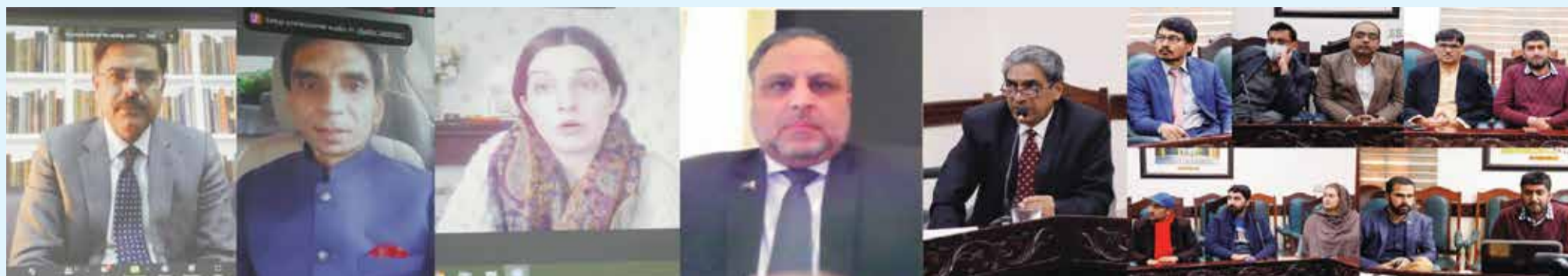
Guest speakers of the online webinar addressing with the participants