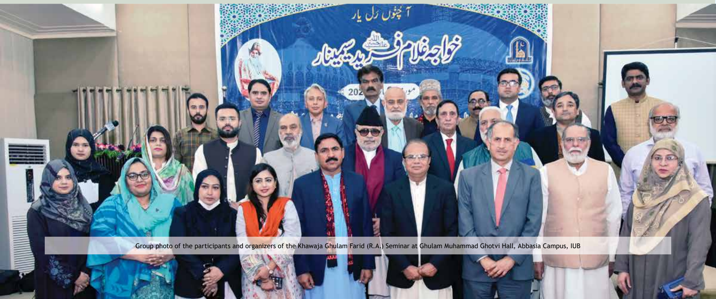
Group photo of the participants and organizers of the Khawaja Ghulam Farid (R.A.) Seminar at Ghulam Muhammad Ghotvi Hall, Abbasia Campus, IUB