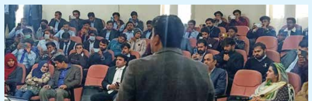
A view of the training session