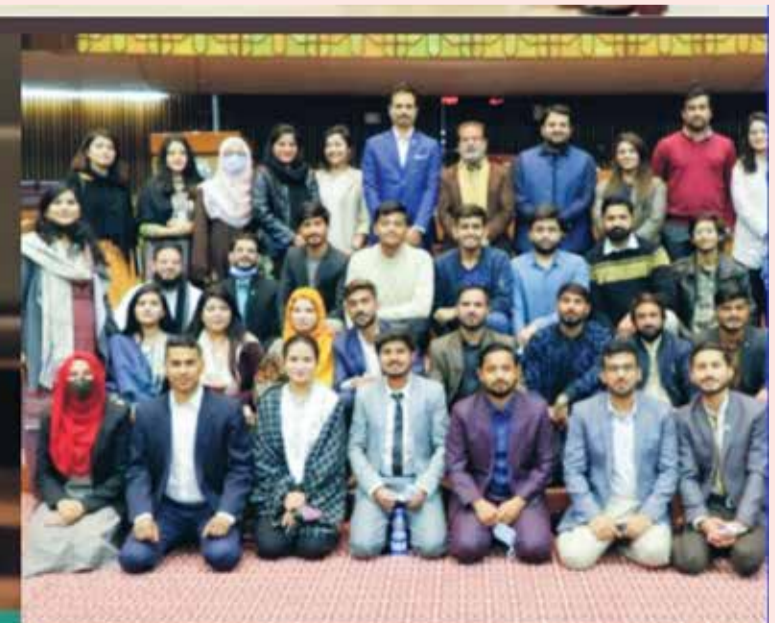
Group Photo of the participants of Future Youth Activists Program