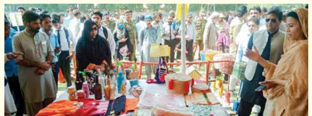
Punjab Cultural Day Celebrations at IUB Bahawalnagar Campus