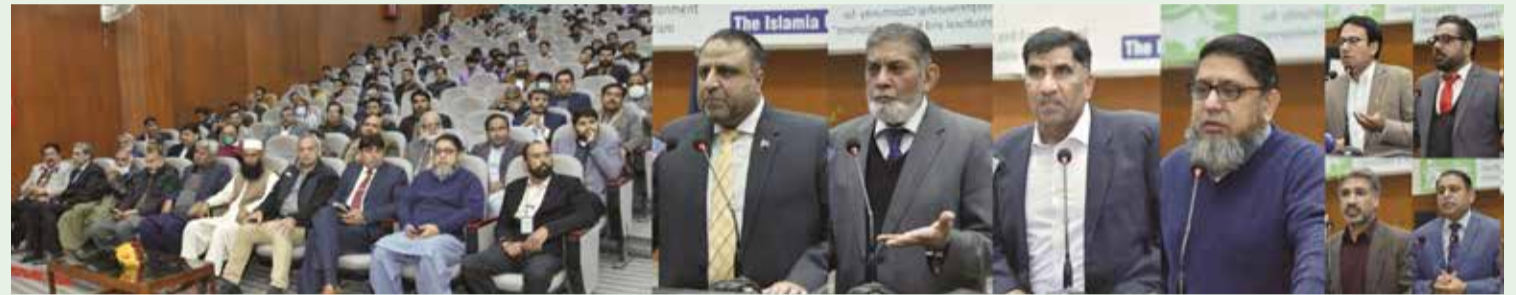
Speakers of 8 th National Agri-Tourism Conference addressing in the inaugural session