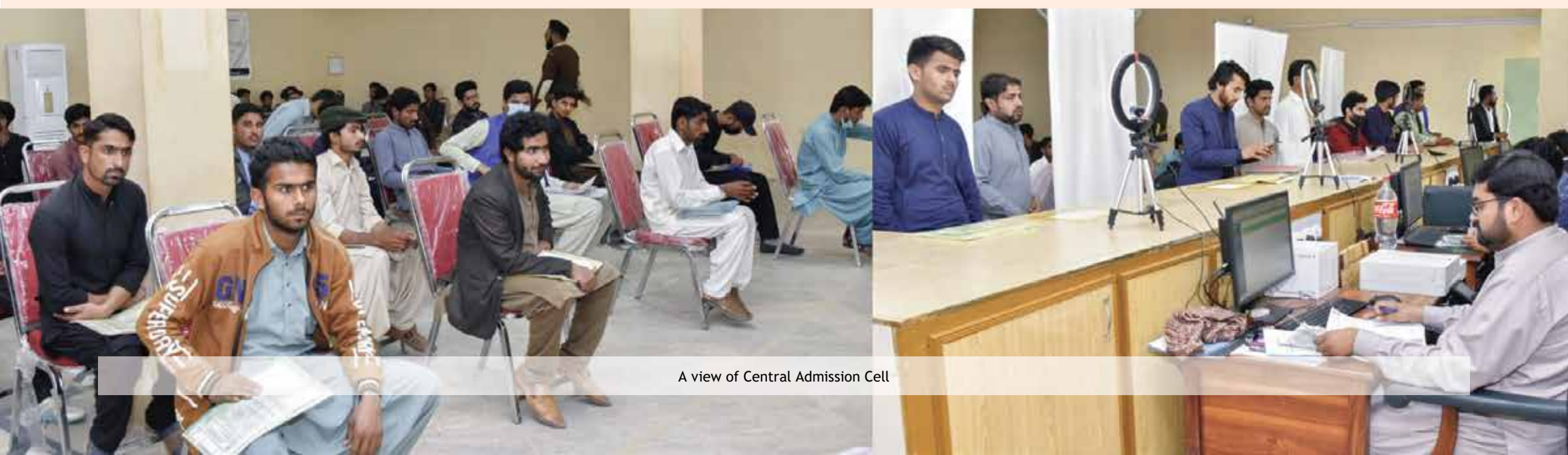
A view of Central Admission Cell

Yar Khan, Bahawalnagar city but also to Lodhran, Yazman, and the services extended for the students of Ahmadpur East, Khanqah Sharif, Khairpur Tamiwali and Lal Sohanra and the students are being provided with comfortable and quality travel facility. Medical facilities at all campuses were upgraded and 3 new ambulances were provided. The Islamia University of Bahawalpur became the first Hepatitis Free University in the country. The fees of the Islamia University of