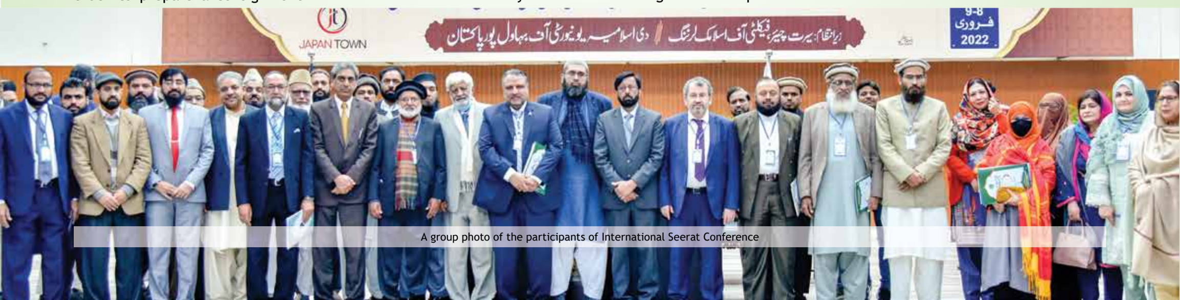
A group photo of the participants of International Seerat Conference