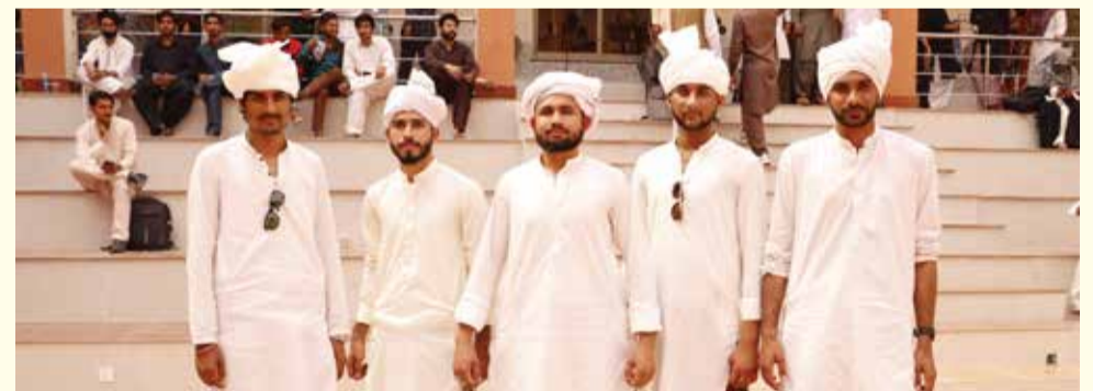
Punjab Cultural Day Celebrations at University College of Art and Design, BJC

students of IUB, Schools, Punjab College, Kips College and other educational institutions. A cultural show on folk songs was presented which was well appreciated by the audience. In addition, handicrafts stalls were set up by the Social Welfare Department Bahawalnagar to showcase the local handicrafts of the region.