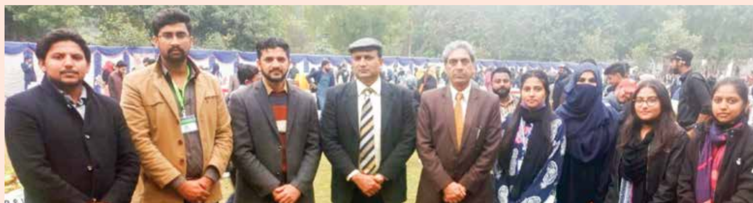
Group photo of participants of Eco-Food Party

G reen Campus Project the Islamia University of Bahawalpur, IUB Green Youth Movement (GYM), Department of Economics and University College of Arts and Design organized the Eco Food Party at Baghdad ul Jadeed Campus, the Islamia University of Bahawalpur. This initiative was a part of the activities to create awareness about environment friendly activities on campus. The party was conducted with the motivation to demonstrate social gatherings that can be arranged without using disposable items. A most important feature of this food party was the generation of zero trash despite participation by a large number of the students. Each aspect of the party like decorations,