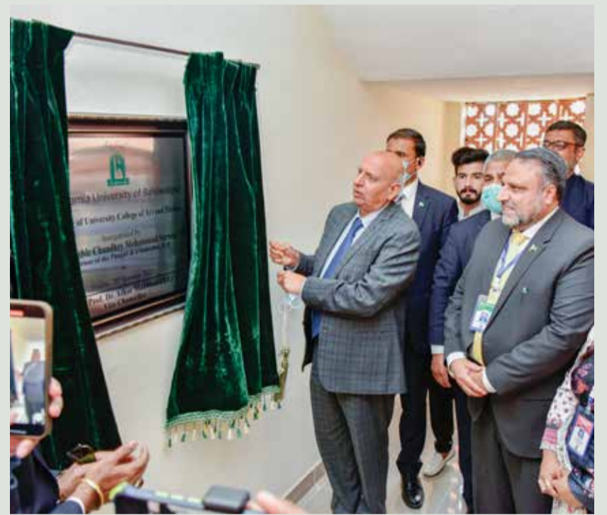
Governor Punjab Chaudhry Mohammad Sarwar inaugurating building of University College of Art and Design