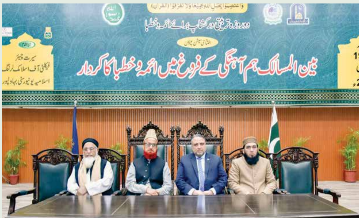
A view of Training Workshop on Aima and Khutba