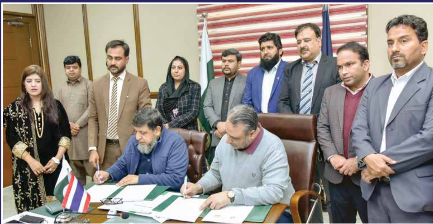
A view of MoU signing ceremony

of teaching and research. Under the faculty and student exchange program, faculty and researchers from both the universities will be able to continue their teaching and research activities. Students of both the universities will not be charged any additional tuition fee. Both universities will issue special scholarship funds for students and faculty. In addition to publish joint research projects and research materials, the two organizations will also hold conferences, seminars and workshops. On the occasion, President Kanchana Ngourunsi said that the cooperation between the two universities in the field of digital supply chain management is very pleasant and it will open the door for mutual cooperation between the two institutions. She said that digital supply chain management is very important department and thanked the Vice Chancellor Engr. Prof. Dr. Athar Mahboob for his support and initiatives in the fields of education and research.