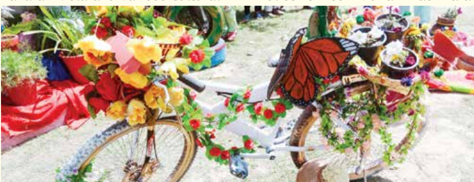
Punjab Cultural Day Celebrations at IUB Bahawalnagar Campus