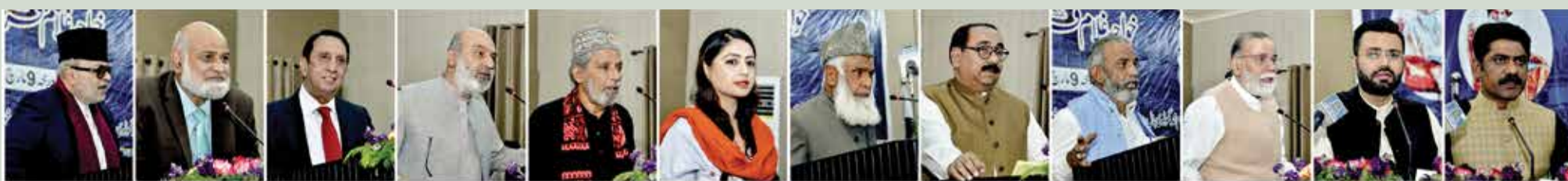
Guest Speakers of the Grand Khawaja Ghulam Farid Seminar at Ghulam Muhammad Ghotvi Hall, Abbasia Campus

The Islamia University of Bahawalpur organized a grand seminar on Khawaja Ghulam Farid (R.A.) to convey the message of religion, spirituality, peace and love of the great Sufi poet Hazrat Khawaja Ghulam Farid to the new generation. The seminar was attended by Faridiyat experts from