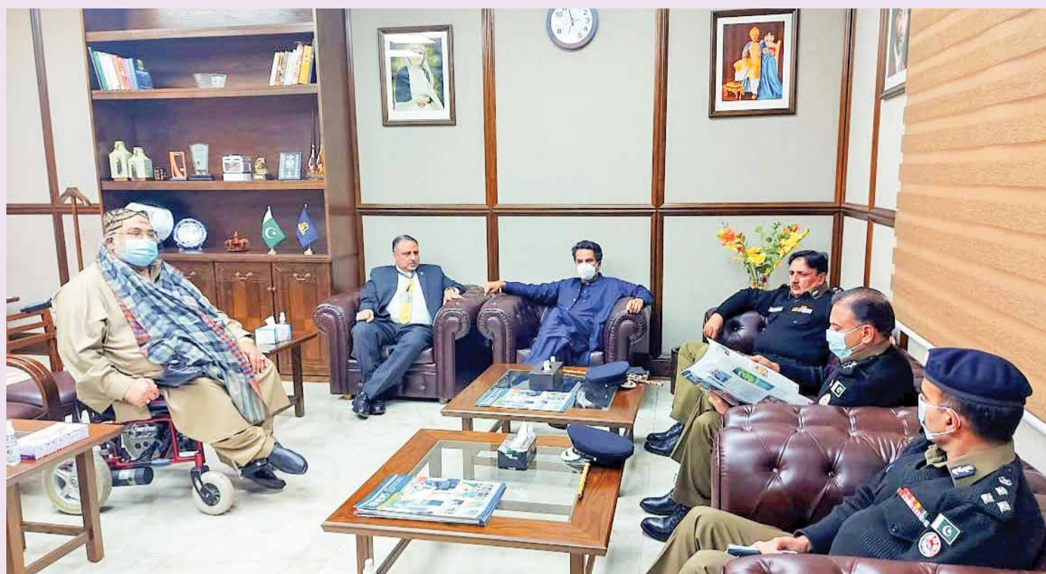
A view of the meeting of Provincial Minister for Finance and IG Punjab Police with Vice Chancellor