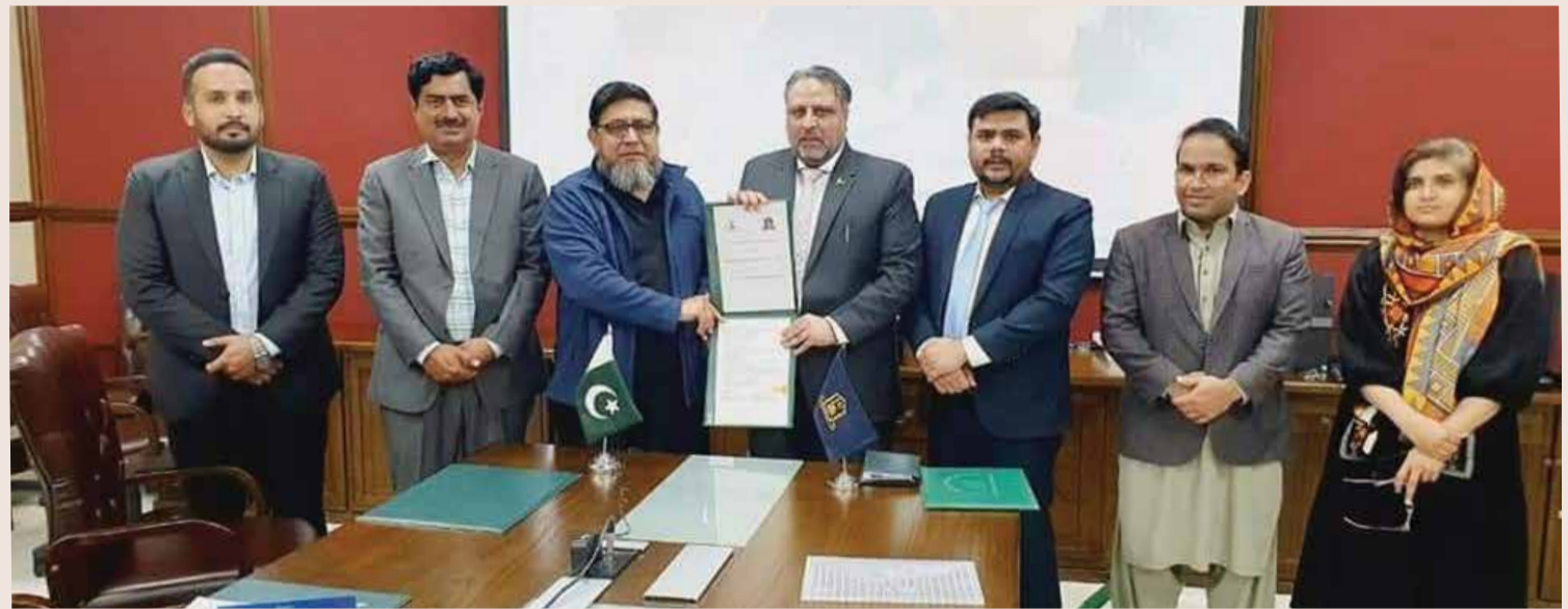
A view of MoU signing ceremony