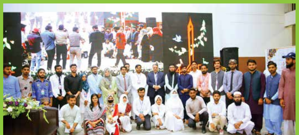
Glimpses of Bahawalpur Literary and Cultural Festival 2022