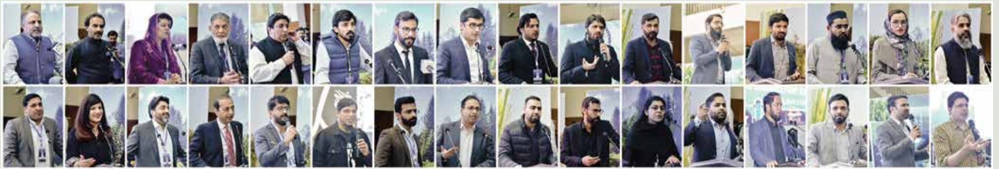
Speakers of Pakistan's First Tech Nation Digital Conference at IUB