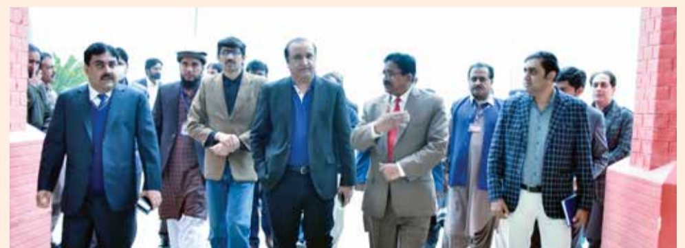
Delegation of Government Colleges University Hyderabad Visits Abbasia Campus