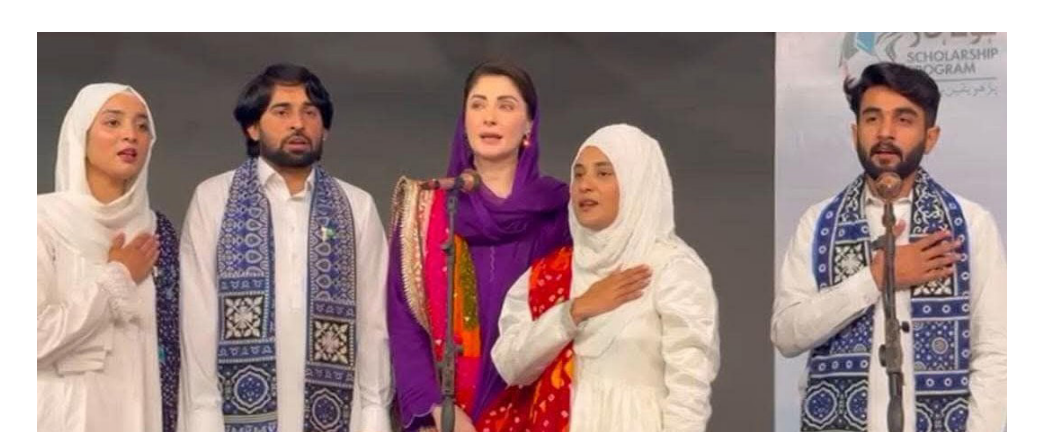
Chief Minister Maryam Nawaz joins students to sing the National Anthem