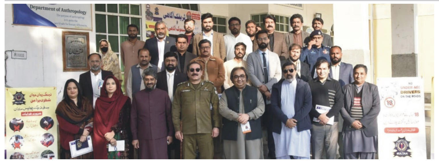
A group photo of participants along with faculty members, officers and students

■ The Department of Anthropology and Applied Psychology of the Islamia University of Bahawalpur jointly organized a seminar on Traffic Management, Traffic Laws and Citizens' Responsibilities. Chief