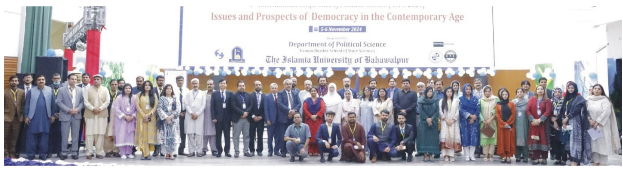
Group photo of the conference delegates

presented the recommendations of the conference in the concluding session.