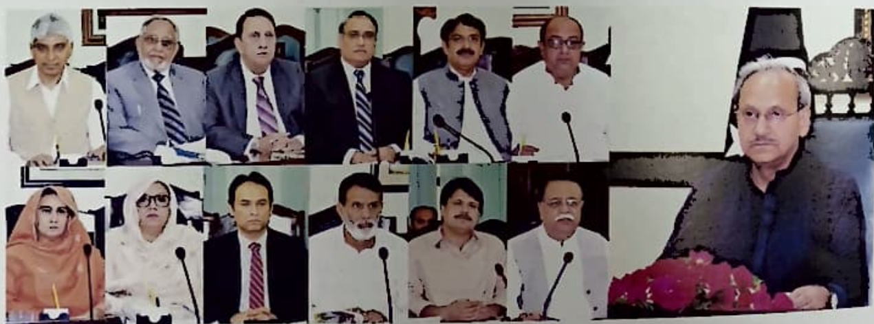
The 66 th meeting of the syndicate