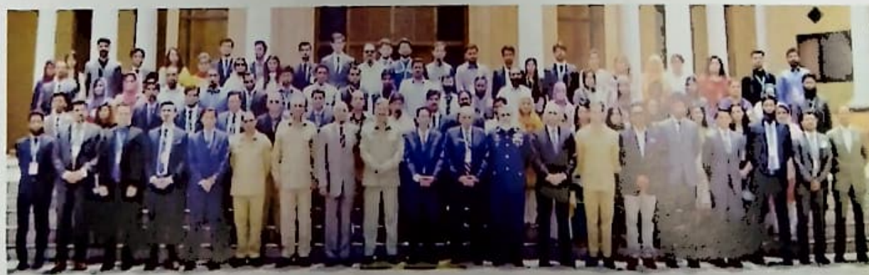
Group photo of workshop participants

challenges of Pakistan. The plenary session was about the "Evolving Concept of Comprehensive National Security and its relevance to Pakistan". Day 1 of the workshop titled 'Counters of whole of nation approach, the need of state -society and soldier-citizens bonding within the framework of national security, 'Information as an element of national security paradigm, Elements of national power and the role of military. Day 2 of the workshop discussed the topics of Pakistan's traditional /conventional security challenges, Pakistan peculiar sub-conventional/hybrid threats and contribution of Armed force in peace, Internal security mosaic of Karachi and response of armed forces,