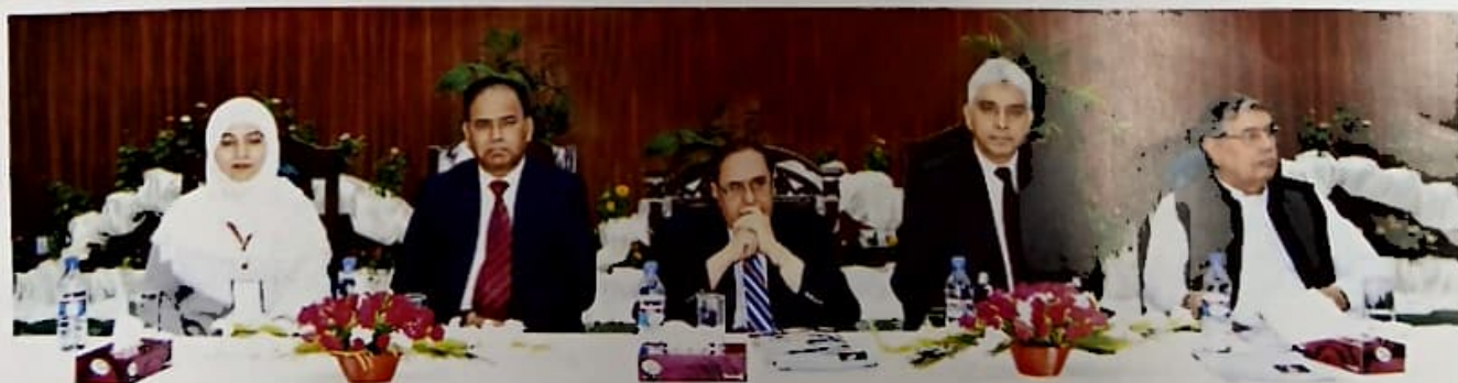
A view of inaugural session

students abroad for higher education and this number is increasing day by day. Increment in salaries and benefits of teacher, establishment of educational institutions across Pakistan, improvement in IT infrastructure is also showing the importance of education system in Pakistani society. According to the research of Thomson Reuters in 2006, Pakistan is equal in rank of India, China, Russia and Brazil in the field of research and development. The speakers presented many recommendations on biodiversity and climate changing majorly included; land and water protection, reduction in direct pressure on biodiversity and promote sustainability, adoption of deforestation solutions, establishment of nurseries for plants, involvement of farmers in awareness and implementation activities, plantation at small units, creation of organic farming/green strategies/research studies on biodiversity and