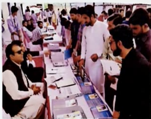
Students gathered at stall of the Islamia University of Bahawalpur seeking information about admissions in various educational programmes

Hundreds of students thronged toward stalls of the Islamia University of Bahawalpur in educational expos recently held in Mansehra, Haripur and Multan. The Islamia University of Bahawalpur actively participated and presented educational programmes in Higher Education Commission's organized educational exhibitions in Haripur and Mansehra and another expo organized by a renowned media group in Multan. The students and parents were keen in seeking information about IUB educational programmes in Engineering, Pharmacy, Chemistry, Veterinary, Management Sciences, Information Technology, Media Studies, Agriculture and basic sciences.