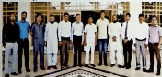
Delegation of NAEAC with faculty of Agriculture College