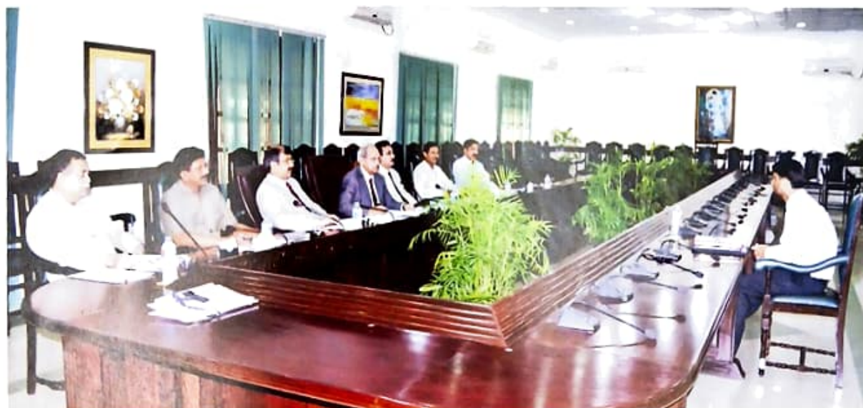
A view of selection board meeting

Professors, 8 Associate Professors and 109 Assistant Professors were appointed. During the current phase, university is expected to fill vacant posts of faculty members at Professor and Associate Professor level to culminate adhocism prevailing in the university since decades as university cannot appoint administrative heads of faculties and teaching departments without having regularly appointed senior faculty members. It is expected that before the commencement of new academic session, the University will be able to fill vacant positions in teaching departments which will ultimately pave the way for standardization in academia and research, already improved significantly during the last two years.