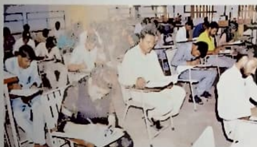
Students participating in Engineering College admission test at the Islamia University of Bahawalpur