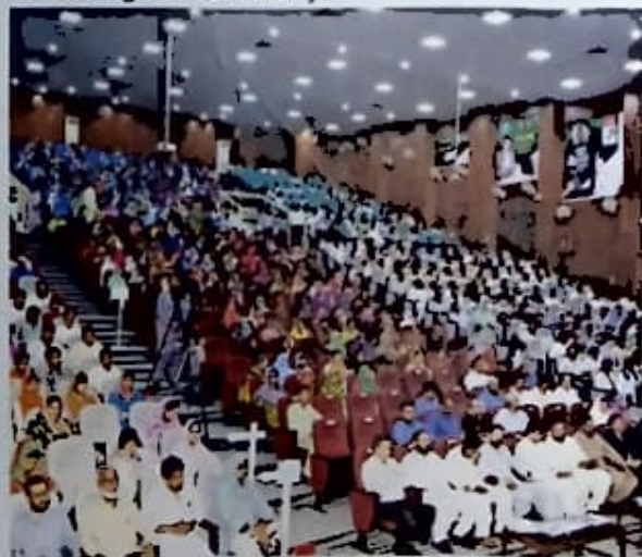
A view of participants of laptop distribution ceremony