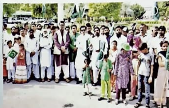
Independence Day celebrations at Abbasia Campus