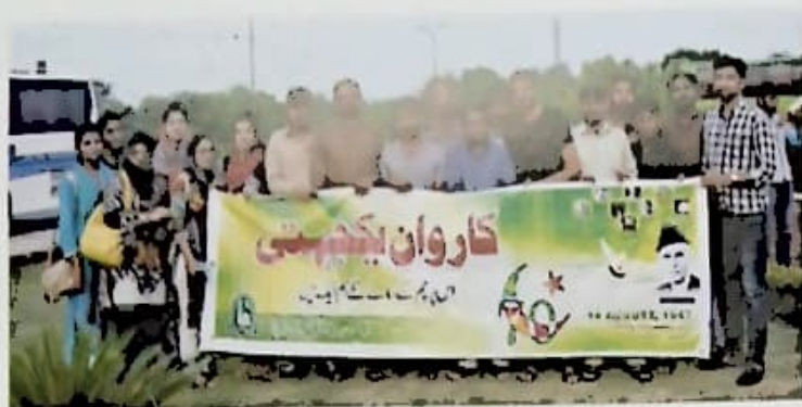
IUB students at Quetta Garrison during Karwan e Yakjehti

Balochistan University of Information Technology, Engineering & Management Sciences. The conference had an interactive session because a panel of participants comprised of provincial and federal politicians from Baluchistan and the Vice Chancellor from Baluchistan University of Information Technology. There students raised various questions related to politics, education, economic stability and problems related to the