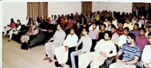
Students are participating in interactive session of Punjab Education Endowment Fund

during the academic year 2014-15, 156 students availed scholarship of Rs. 19.8 million while 596 students of academic session 2015-16 were provided Rs. 64.8 million scholarships.