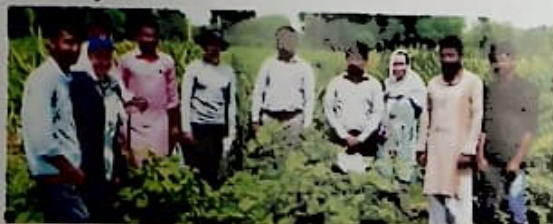
A joint research team of the Islamia University of Bahawalpur and University of Hohenheim Germany working in experimental area of Agriculture College at Baghad ul Jadeed Campus