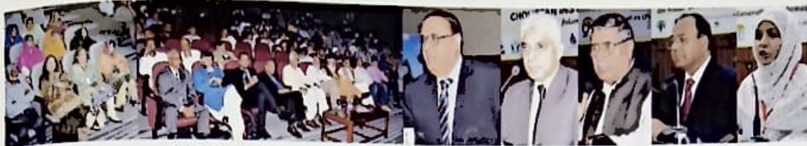
Prof.Dr. Ata ur Rehman and other speakers giving address during inaugural session

public awareness programmes and development of value chains, and enhancing expertise of local communities for species recovery and habitat restorations. The conference ended with the statement "Go ahead in the technology but don't disturb the ecology".